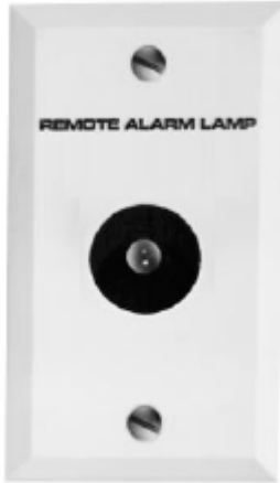
Model RL-HW [Wall]