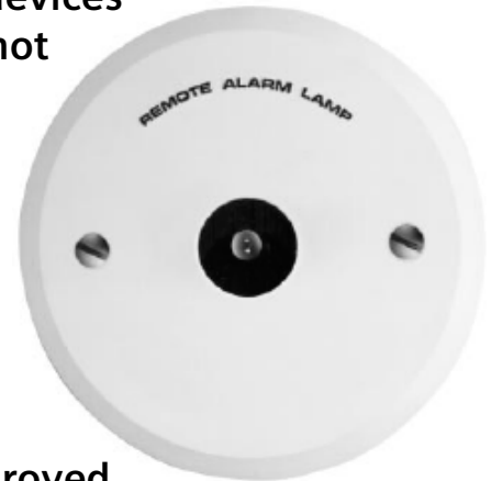
Model RL-HC [Ceiling]